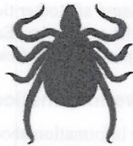
Female adult tick (approximately 10 times actual size)